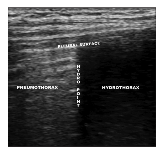
Figure 1: Hydro point in right-sided lung suggestive of hydropneumothorax

POCUS has become a popular game-changer in the field of emergency medicine and expanding exponentially beyond boundaries. Attention to the fluid characteristic in ultrasound can give a clue to the type of effusive pneumothorax. The echotexture of the fluid compartment can be anechoic, echogenic, or with multiple microbubbles, which may denote hydropneumothorax, hemopneumothorax, and pyopneumothorax, respectively. The sonographic accuracy of diagnosing pneumothorax and pleural effusion when occurring in isolation is very high. When hydrothorax and pneumothorax coincide within the pleural cavity, they produce a characteristic