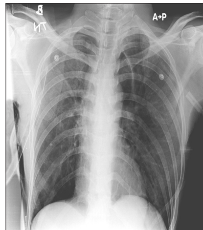
Figure 2: Follow up X-ray chest showing well-expanded lung fields on both sides