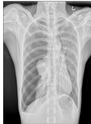
Figure 1: X-ray chest showing significant right-sided hydropneumothorax with associated collapse of the right lung

The exact mechanism of REPE is still not understood. REPE appears to be due to increased permeability of the pulmonary vasculature. High protein content found in edema fluid indicates that it is leakiness of the capillaries rather than an increased hydrostatic pressure difference that leads to the edema. Lung injury could also occur due to reperfusion and oxygen free radical formation in the collapsed lung. [4] Young adults, female sex, greater degree and longer duration of lung collapse, a reexpansion of lung in <10 min, use of negative pressure during treatment, and evacuation volume more than 2000 ml have been shown to be at a higher risk for developing reexpansion pulmonary edema. Signs and symptoms include sudden onset of breathing difficulty, tachypnea, hypoxia, and tachycardia, usually within 1–2 h of intercostal chest drainage. No studies have been performed comparing the different methods of draining a pneumothorax, but some papers may suggest that the technique of draining