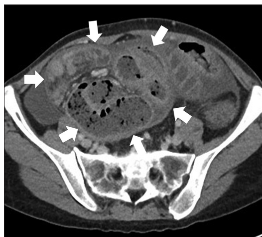
Figure 2: Axial computed tomography shows that the small intestinal loops are encased by the thick and sac-like membrane (white arrow). Dilatation of the small intestine and thickening of the intestinal wall are observed inside the sac