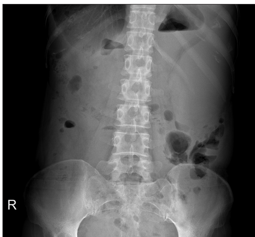
Figure 1: Abdominal X-ray (erect) shows no specific findings suggestive of intestinal obstruction

SEP is characterized by partial or complete enclosing of the small intestines by a thick fibro-collagenous membrane, which gives the appearance of a cocoon within the peritoneal cavity. Because of this feature, it is also known as “abdominal cocoon” and “encapsulating peritoneal sclerosis.” SEP is classified as primary or secondary depending on the underlying cause. Primary SEP is idiopathic, and the etiology remains unclear. The primary SEP was reported to occur more commonly in tropical and subtropical countries. On the other hand,