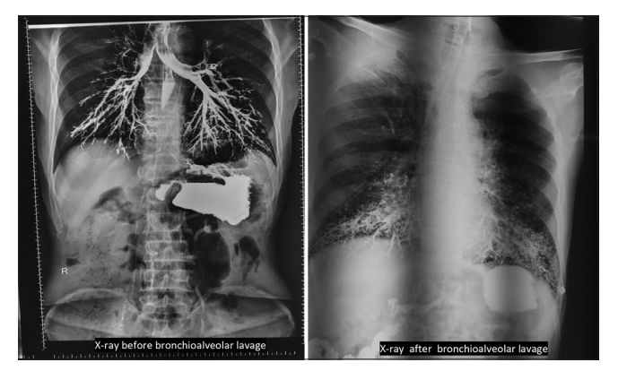
Figure 1: X-ray before/after bronchioalveolar lavage

There are two types of barium particles present inside the lung after aspiration: one that adheres to epithelial