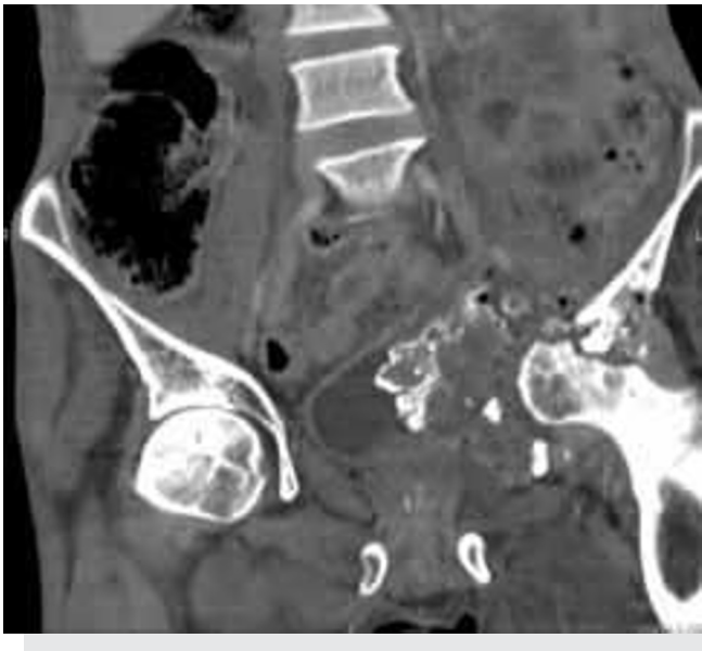
Figure 1. Contrast enhanced abdomen CT showing the iliac bone fracture.

gauge IV line was inserted and 2000 ml of normal saline infusion was started. The abdominal ultrasound scan revealed that there was only a small amount of urine in the bladder. It also showed free fluid in the peritoneal cavity. A contrast enhanced computed tomography (CT) scan of the abdomen and retrograde CT cystogram were ordered. The CT scan showed a 10 cm x 9 cm mass with soft tissue components at the left iliac bone along with a pathological fracture and