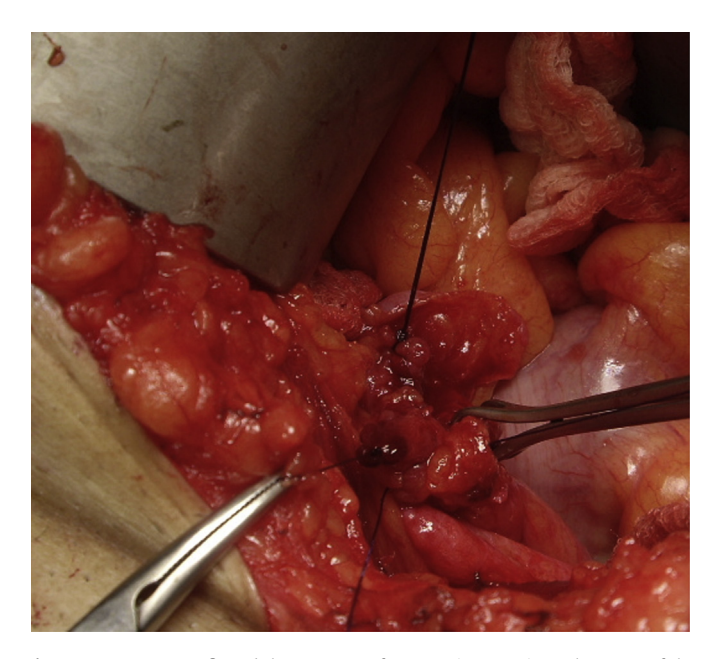
Fig. 2. Laparotomy confirmed the presence of a 10 cm intra-peritoneal rupture of the dome of the urinary bladder which was closed in 2 layers using Vicryl 3/0.

operator having more than 27 years' experience in performing Point-of-Care Ultrasound (POCUS). A clinical diagnosis of major intra-peritoneal rupture of the urinary bladder was made. Contrast was instilled through the Foley catheter followed by CT scan of the abdomen. CT scan showed significant spillage of contrast from the urinary bladder into the peritoneal cavity which confirmed our diagnosis (Fig. 1D). Laparotomy confirmed the presence of a 10 cm intra-peritoneal rupture of the dome of the urinary bladder which was closed in 2 layers using Vicryl 3/0 (Fig. 2). There were no other