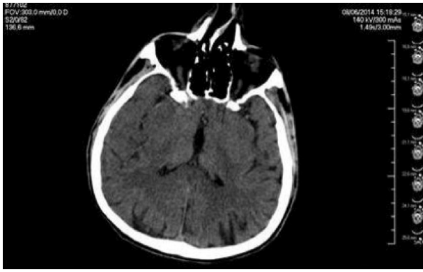
Fig. 1. Axial computerized tomography image of patient. There is no acute changing.

pathologic findings in the computed tomography of the patient (Fig. 1). On the diffusion magnetic resonance imaging (MRI), an acute infarction was detected extending from the right frontotemporal region to the parietal region (Fig. 2). The patient was transferred to the intensive care unit and medical treatment was started. On the second day of follow-up, the patient experienced ventricular tachycardia, and after electrical cardioversion normal cardiac rhythm was obtained. On the third day of follow-up, the condition of the patient worsened and respiratory failure was developed. The patient was intubated and connected to a mechanical ventilator. On the fourth day of follow-up, cardiac arrest developed. Despite cardiopulmonary resuscitation, normal cardiac rhythm could not be obtained and the patient was announced expired.