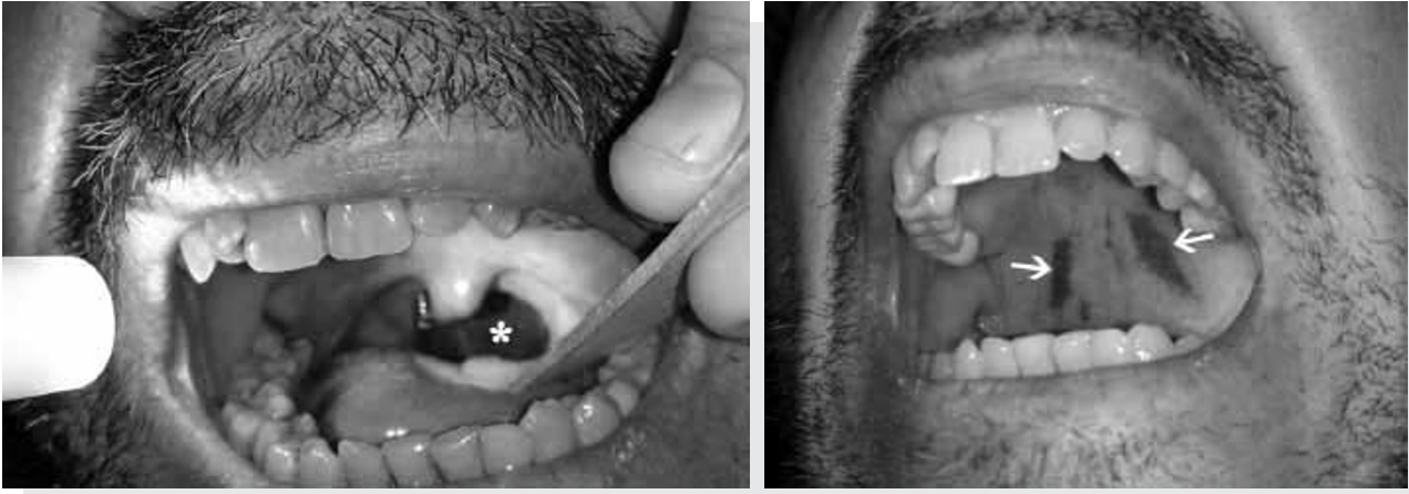
Figure 1. Bilateral neck swelling, a few petechia in soft palate and widespread ecchymosis and edema in pharynx.

and 9.59 g/dl, respectively. In the lateral cervical graphy, pre-vertebral soft tissue thickness at level C2 was measured at 33.5 mm (Figure 2). Noncontrast enhanced computerized tomography (CT) of the neck was performed and revealed retropharyngeal hematoma spread through to subglottic area from nasopharynx (Figure 2).