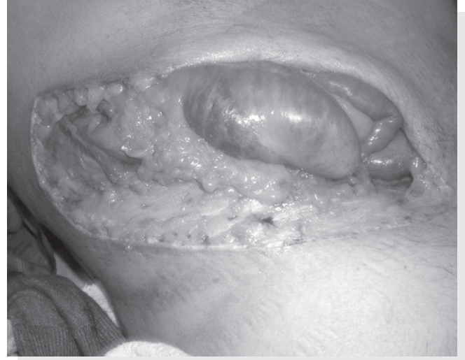
Figure 2. Evisceration in the right lower quadrant of the abdomen.

follow-up and required a psychiatric consultation. Selective serotonin re-uptake inhibitor (SSRI) with tricyclic antidepressants (i.e., amitriptyline and sertraline) were added to the therapy.