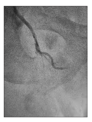
Figure 2: Control angiogram after embolization with the fat tissue