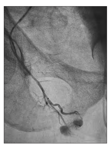
Figure 1: Extravasation from the bleeding artery

As bleeding control is one of the basic tenets of trauma resuscitation which must be addressed proactively, lack of an expected elevation in hemoglobin levels despite blood transfusion raised our suspicions of a re-bleeding. Furthermore, we wanted to avoid the risks of a possible massive transfusion protocol in case of the bleeding control could not be achieved. Although the vital signs of the patient were in normal limits after blood transfusion, base excess level was -7, which indicated the patient is still having a hemorrhagic shock<sup>[9]</sup> [Graph 1]. Thus, we