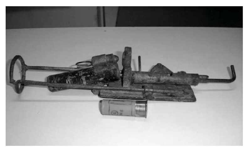
Fig. 1. The view of the mouse trap.

Accidental injuries were frequently seen in young people and children who like to play with guns. Children under age 15 suffered 823 nonfatal, unintentional firearm injuries serious enough to require an emergency department visit, a ratio of 14 nonfatal firearm injuries for every fatality.<sup>[8]</sup> Due to the commonly seen habit of gun possession in the region we live, we predict unintentional gunshot injuries to be very frequent in children. Our case was also in the childhood and he was unintentionally shot by the home made