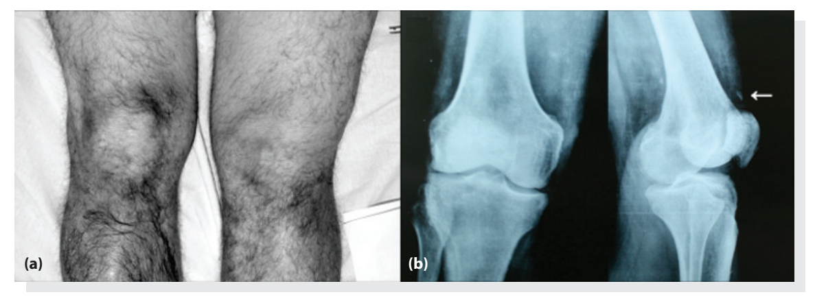
Figure 1. There was soft tissue edema, mild tenderness to palpation of left quadriceps on physical examination (a), soft tissue defects and calcific densities (arrow) near the musculotendinous junctions (b).

[For the diagnosis and teaching points, see page 79]