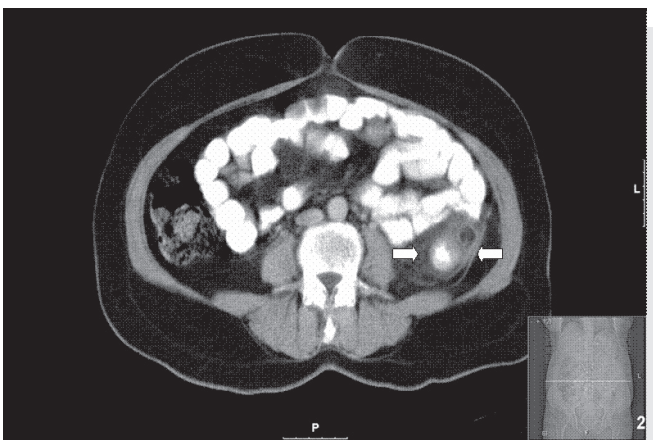
Figure 1. The CT scan shows wall thickening located distal to the descending colon, increased adipose tissue density, and an oval-shaped mass lesion in the paracolic region.

EA is a rare, self-limiting inflammatory disorder which is usually seen in adults aged between 20 and 50 years (Table 1). Certain studies have reported that EA is more prevalent in obese patients. Although it is not a gender specific condition, most reported cases have occurred in males. [1-3] Two of our patients were of the female gender, and one was male. Their ages were consistent with the reported age distribution for the disease.